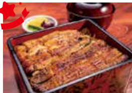
Unaju Tokujo (Special eel rice box) JPY 3,450