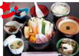
Hoto nabe (Pot of hoto) meal set JPY 1,320