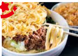
Horsemeat and seaweed tempura udon noodle JPY 700