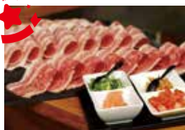
Pork shabushabu (Branded pork named "Fujigane-pork") JPY 1,998~