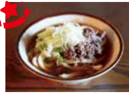
Udon with meat JPY 550