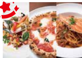
Pizza Margherita JPY 1,400 (tax-excluded)

● We also have seasonal foods and pasta.