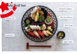
Sushi roll set JPY 2,400~