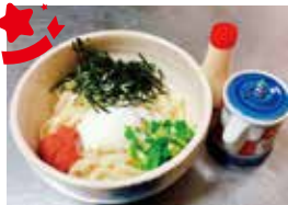
Kamatama Mentai (Udon with egg and mentaiko) JPY 550