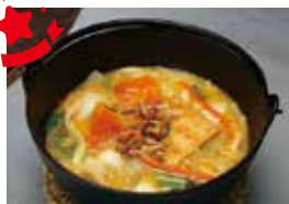
Fudou Houtou JPY 1,210