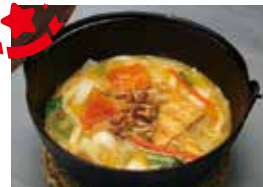
Fudou Houtou JPY 1,210