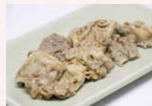
Japanese tripe stew that is popular among locals in Fujikawaguchiko town

or parties. There are also many restaurants that serves local gourmet called "Yoshida no udon" noodle(Introduced on page 11.).These noodles are often topped with salty-sweet stewed horse meat. Horse tripe are also very popular among the townspeople. When you order "Motsuni(Japanese tripe stew)" at Japanese pubs, they often serve horsemeat. Horsemeat has less smell and is easy to eat, and is low in calories and high in protein. It is also rich in iron. If you visit Fujikawaguchiko town, please try it once.