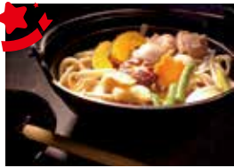
Hoto nabe (Pot of hoto ) JPY 1,650