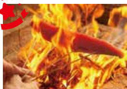
Warayaki (Grilled bonito with straw) JPY 1,680