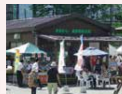
A market in the "oishi" park with a nice view of lake Kawaguchiko and Mt. Fuji

The Oishiya, a farm products direct sales store located in Oishi Park, offers fresh farm products in Yamanashi Prefecture, mainly in the Oishi area. Also note the products that can only be found here, such as hand-made products made by locals.