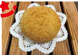
Beans curry bread JPY 200