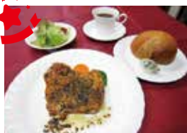
Herb-grilled broiler JPY 1,000