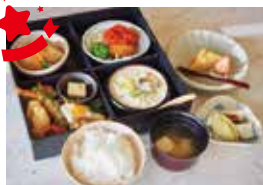
Shokado-style compartment lunchbox JPY 1,500