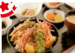
Tendon (Tempura rice bowl topped with wakasagi (lake smelt)) JPY 1,300