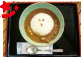
Itoriki's Curry (Japanese style curry) JPY 900