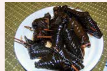
"Memaki" Roll slices of fish with Eisenia and boil it down salty-sweet over 10 hours.

"Memaki" is one of the regional food in Kawaguchi area in Fujikawaguchiko town. It's made with slices of fish and Eisenia which is a kind of seaweed. To make "Memaki", roll slices of fish with Eisenia. Then, boil it down salty-sweet. In this region, Eisenia had been called "me" and in Japanese, roll is pronounced "maku /maki". That's why this food is called "Memaki". "Memaki" was born in the mid Edo period (1710-1790). At that time, there was a small village where "oshi" lived. "Oshi" are the people who take care of climbers on Mt. Fuji. "Oshi" gave climbers "memaki" so that