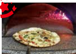
Pizza Margherita JPY 2,200

● English and Italian menus are available.