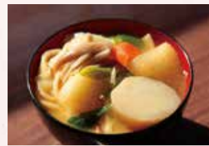
Hoto is a popular regional dish. It is a hot pot dish stewing flat Udon noodles and vegetables in miso soup

In Fujikawaguchiko town, upland farming has developed rather than rice cultivation. For this reason, flour foods such as "Hoto" and udon noodle have long taken root. In the past, udon was a sacred thing to eat at ceremonial occasions. In the Showa era, in the Fujiyoshida city where the textile industry developed, people can enjoy a bowl of udon as a convenient lunch during work. These are the roots of today's "Yoshida-no-udon". After the war, many