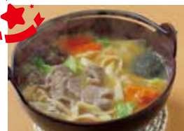
Ogon (Golden) Hoto JPY 1,430 (tax-excluded)