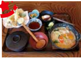
Hoto meal set with lake smelt JPY 1,760