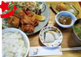
Tendon (Tempura Rice Bowl) JPY 1,300