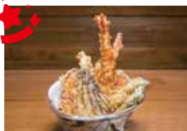
Tendon (Tempura bowl) JPY 1,600