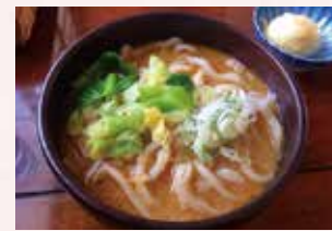
"Yoshida-no-udon" which has its roots in Fujiyoshida city next to this town