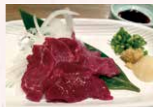
Horse meat sashimi called "Basashi" is lean and healthy