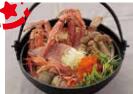
Seafood Hoto JPY 1,848