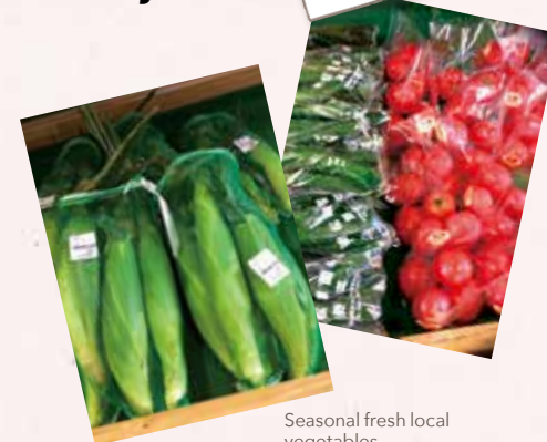
Seasonal fresh local vegetables