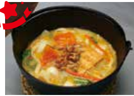
Fudou Houtou JPY 1,210