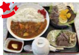
Venison curry with rice set JPY 1,800