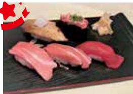
Toro nigiri (fatty tuna sushi) JPY 2,100