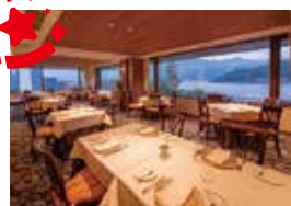
Lunch Course JPY 4,840~

● Authentic french dishes and nice view of lake Kawaguchiko