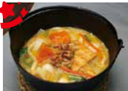
Fudou Houtou JPY 1,210