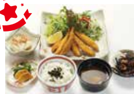
Set meal with wakasagi (Lake smelt) JPY 1,690