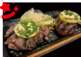
Japanese black beef hamburger steak Rib steak combo